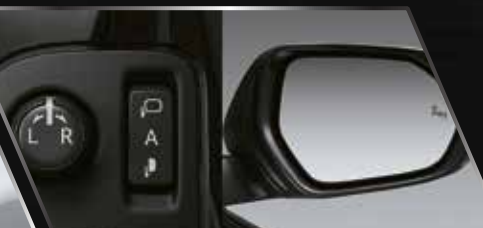
ELECTRICALLY RETRACTABLE OUTER MIRROR