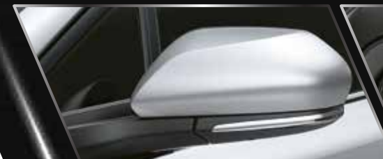
OUTER MIRROR WITH SIDE TURN SIGNAL LAMP