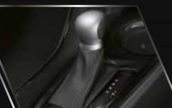
7-SPEED CVT SEQUENTIAL SHIFTMATIC ENSURES A HIGH LEVEL OF DRIVABILITY, SMOOTHNESS, QUIETNESS, AND FUEL ECONOMY.