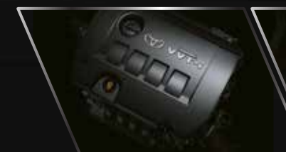
2ZR-FBE 1.8L DELIVERS EXCELLENT BALANCE OF POWER AND FUEL EFFICIENCY.